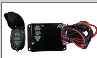
Optional Wireless Remote